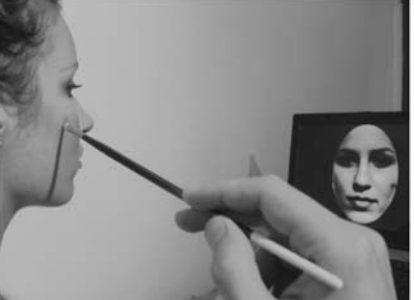
Figure 1. Figure 1 shows the morphing procedure and the direction of morphing (from "self to other" or from "other to self") displayed in the two types of movies (Fig 1a), and the experimental set-up during the visuo-tactile stimulation (Fig 1b). doi:10.1371/journal.pone.0004040.q001